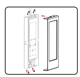
Secure the Cover Screw the Front Cover (3) back in.