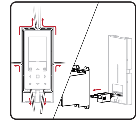
Configure the Cable The cables can be arranged in multiple directions.