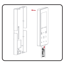
Insert Micro USB Adapter

Insert Micro USB Adapter (19) before attaching the Wall Controller to the Back Plate (20).